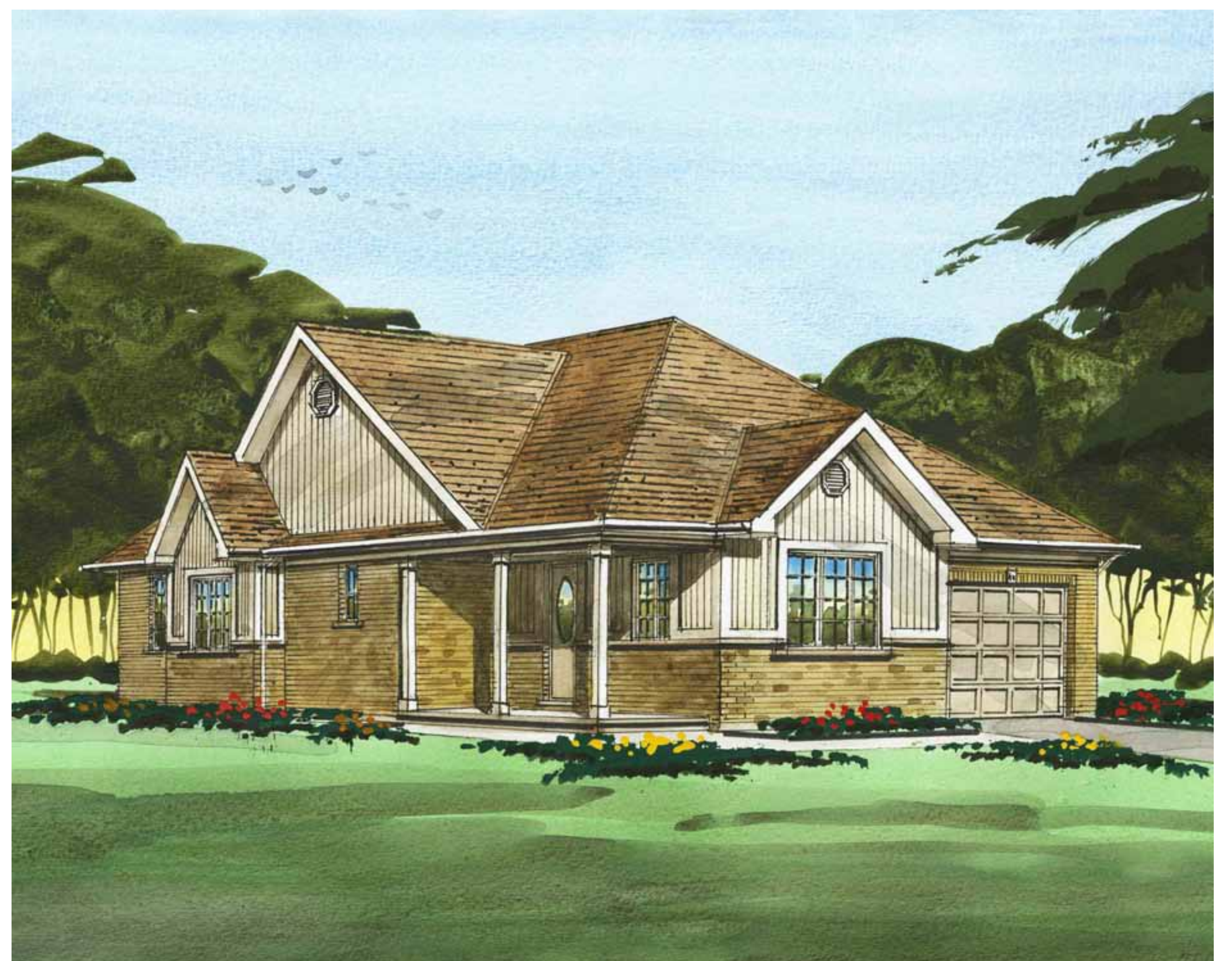
ELEVATION B (Artist's concept)

All dimensions are approximate and generally comprise the greater width by the greater length. Actual usable floor area may vary from that stated, which includes open areas and finished below grade areas where applicable. Appliances are not included. Elevation renderings are artist's concepts. All floor plans and elevations are copyrighted © 2010 Tillsonburg Developments Inc. E&OE. October 2010