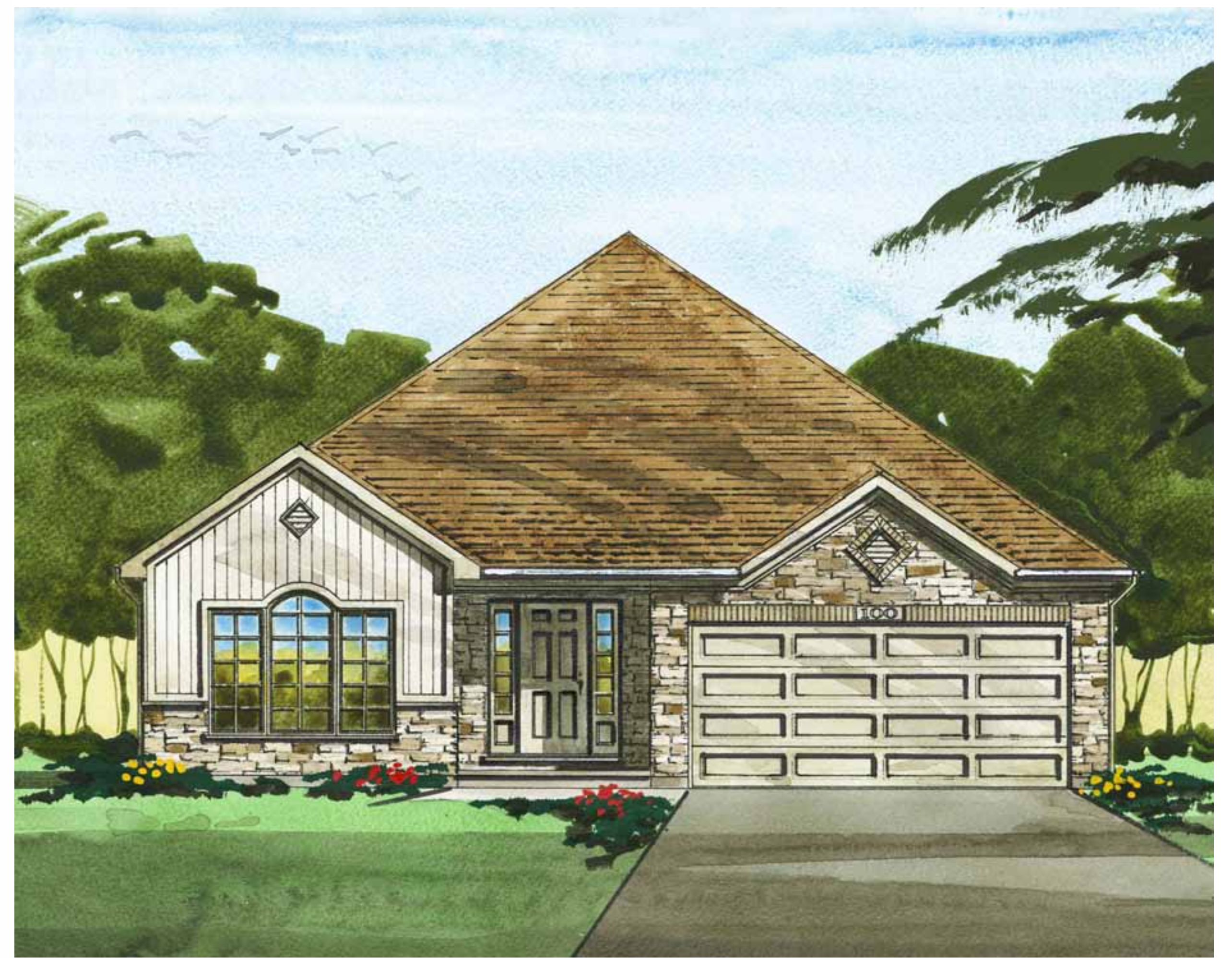
ELEVATION B (Artist's concept)

All dimensions are approximate and generally comprise the greater width by the greater length. Actual usable floor area may vary from that stated, which includes open areas and finished below grade areas where applicable. Appliances are not included. Elevation renderings are artist's concepts. All floor plans and elevations are copyrighted © 2010 Tillsonburg Developments Inc. E&OE. October 2010