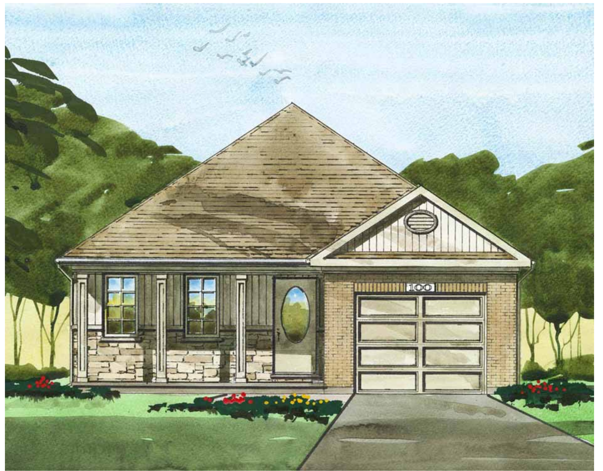
ELEVATION B (Artist's concept)

All dimensions are approximate and generally comprise the greater width by the greater length. Actual usable floor area may vary from that stated, which includes open areas and finished below grade areas where applicable. Appliances are not included. Elevation renderings are artist's concepts. All floor plans and elevations are copyrighted © 2010 Tillsonburg Developments Inc. E&OE. October 2010