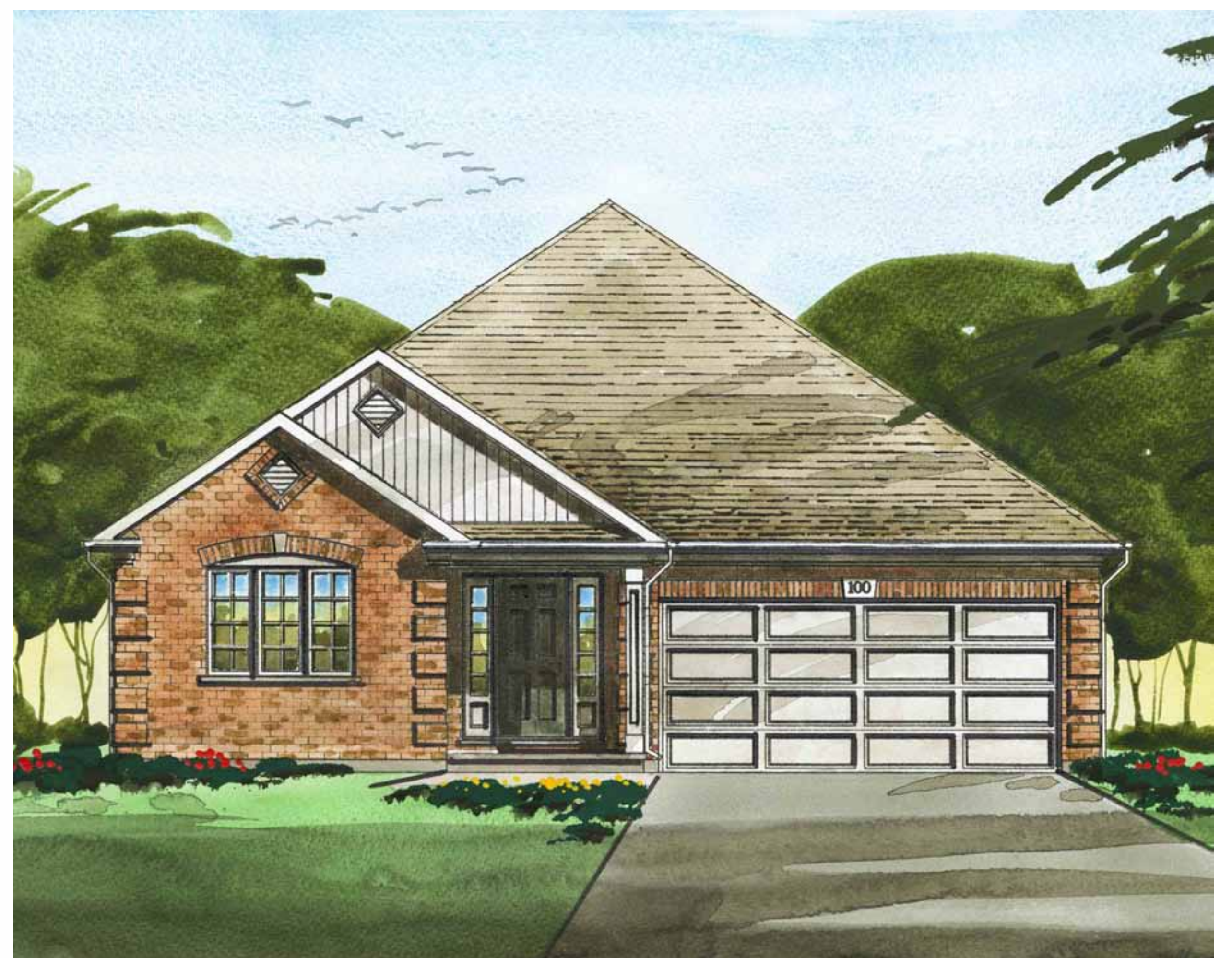
ELEVATION A (Artist's concept)

All dimensions are approximate and generally comprise the greater width by the greater length. Actual usable floor area may vary from that stated, which includes open areas and finished below grade areas where applicable. Appliances are not included. Elevation renderings are artist's concepts. All floor plans and elevations are copyrighted © 2010 Tillsonburg Developments Inc. E&OE. October 2010