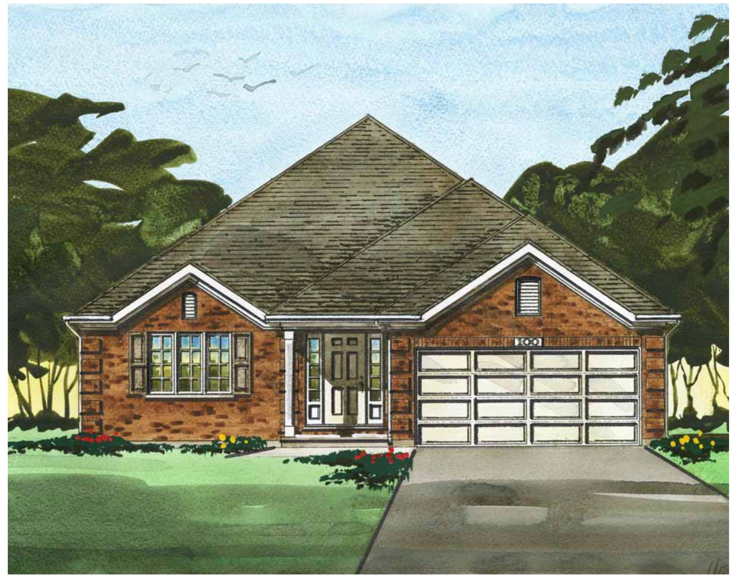
ELEVATION A (Artist's concept)

All dimensions are approximate and generally comprise the greater width by the greater length. Actual usable floor area may vary from that stated, which includes open areas and finished below grade areas where applicable. Appliances are not included. Elevation renderings are artist's concepts. All floor plans and elevations are copyrighted © 2010 Tillsonburg Developments Inc. E&OE. October 2010