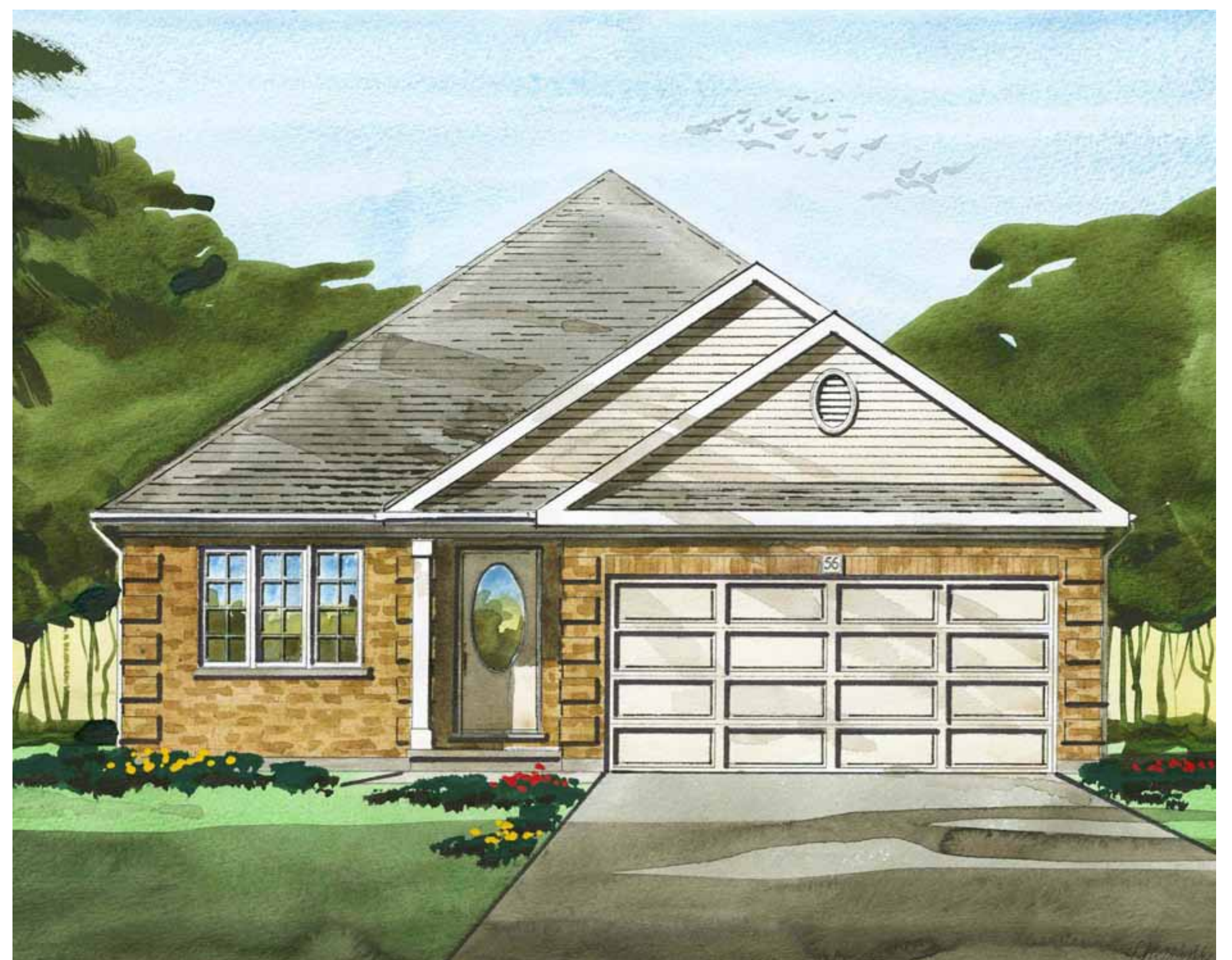
ELEVATION A (Artist's concept)

All dimensions are approximate and generally comprise the greater width by the greater length. Actual usable floor area may vary from that stated, which includes open areas and finished below grade areas where applicable. Appliances are not included. Elevation renderings are artist's concepts. All floor plans and elevations are copyrighted © 2010 Tillsonburg Developments Inc. E&OE. October 2010