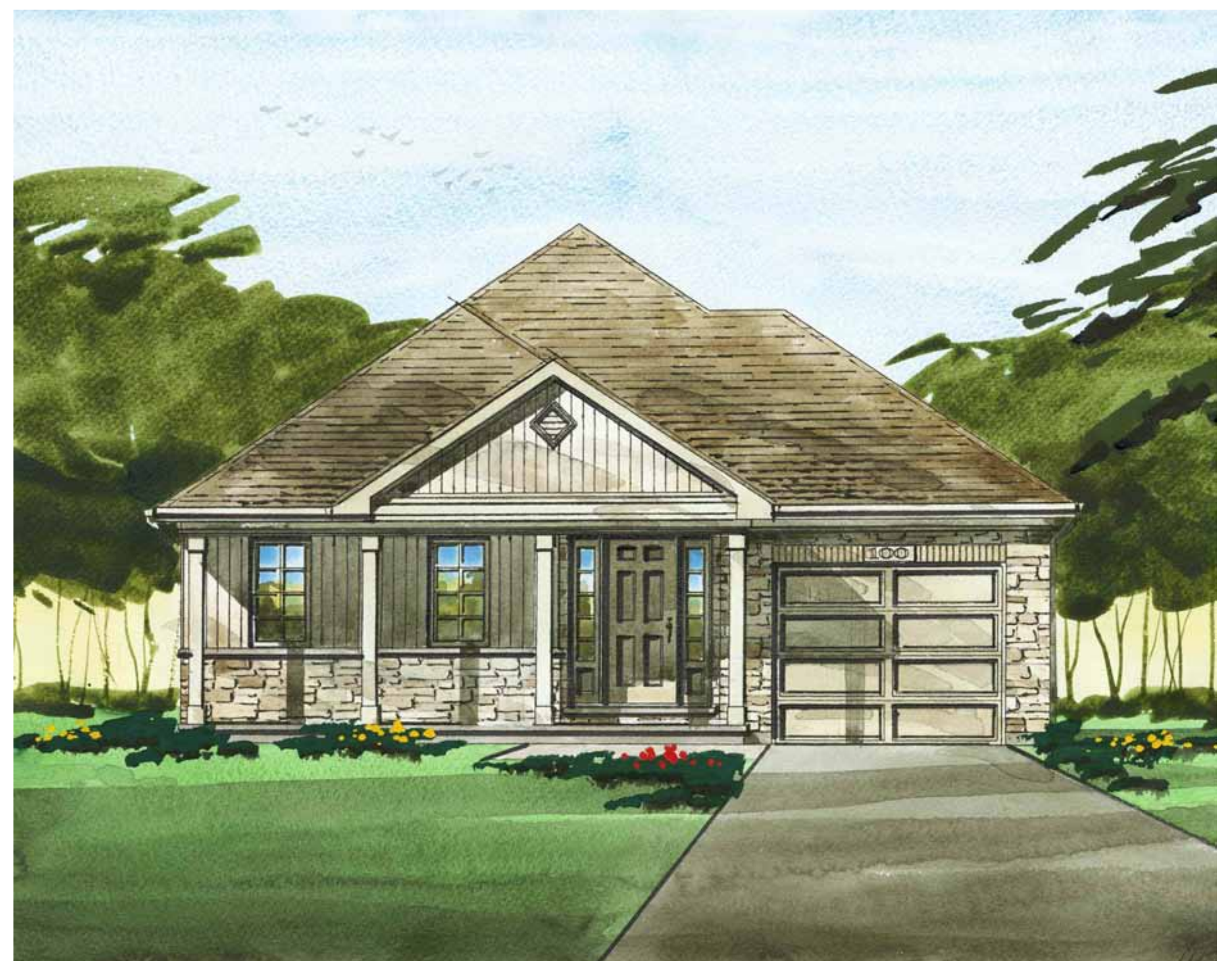
ELEVATION B (Artist's concept)

All dimensions are approximate and generally comprise the greater width by the greater length. Actual usable floor area may vary from that stated, which includes open areas and finished below grade areas where applicable. Appliances are not included. Elevation renderings are artist's concepts. All floor plans and elevations are copyrighted © 2010 Tillsonburg Developments Inc. E&OE. October 2010