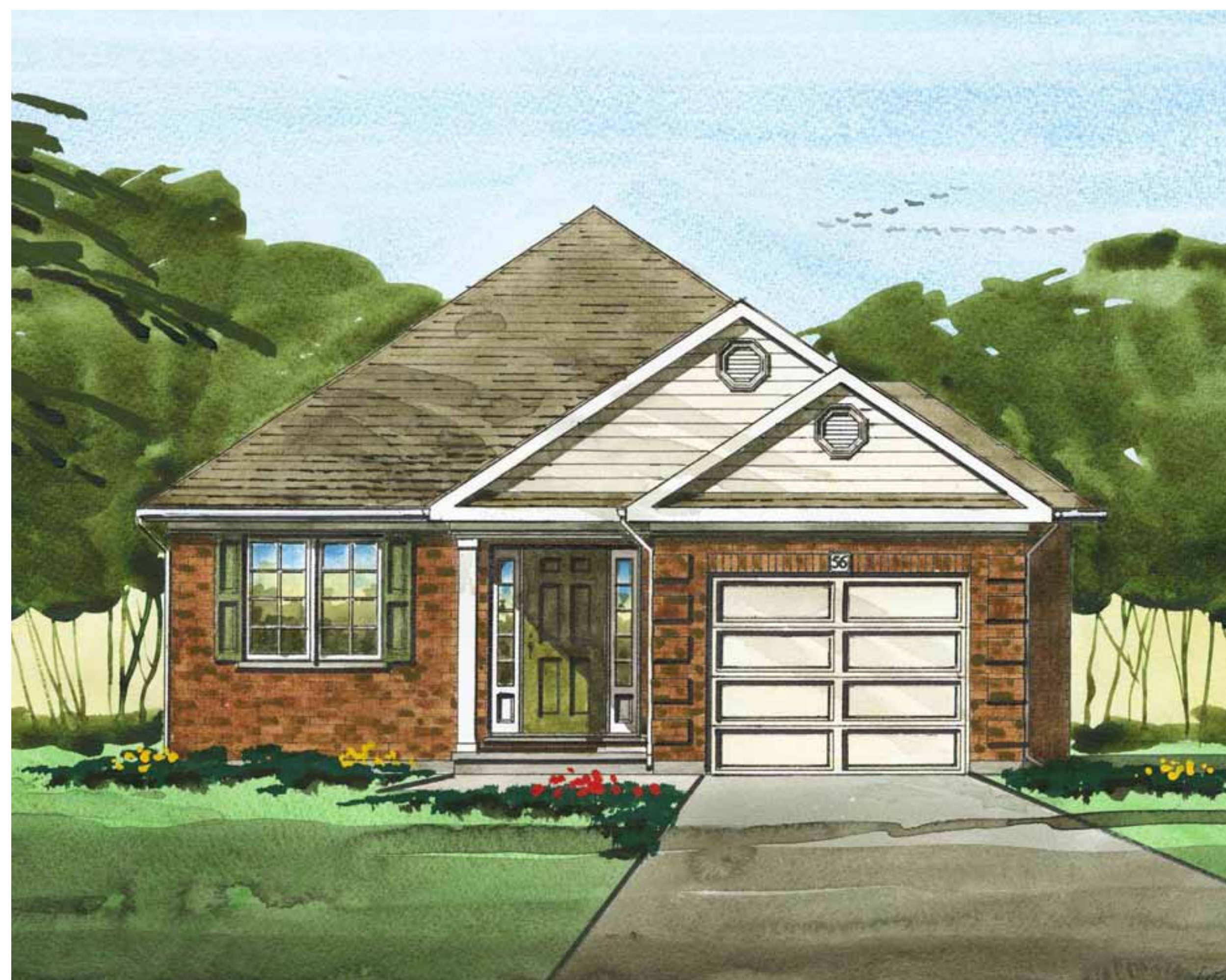
BROCKENHURST, ELEVATION A 1052 SQUARE FEET (Artist's concept)

All dimensions are approximate and generally comprise the greater width by the greater length. Actual usable floor area may vary from that stated, which includes open areas and finished below grade areas where applicable. Appliances are not included. Elevation renderings are artist's concepts. All floor plans and elevations are copyrighted © 2010 Tillsonburg Developments Inc. E&OE. October 2010